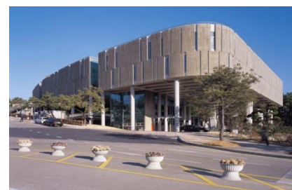
<Pai Chai University's Dormitory and Classroom Buildings>

o Required documents [Please refer to the table – Checklist for Application Documents]