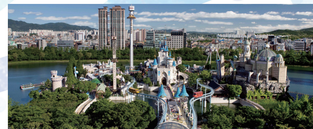
< Lotte World amusement park >

http://www.everland.com/web/multi/english/everland/main.html