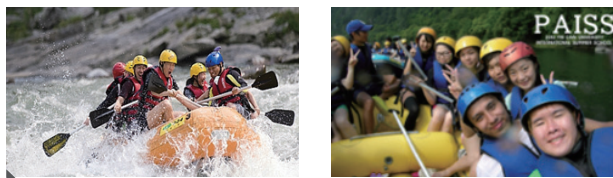
< White-Water Rafting >