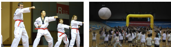
< Athletics Competition >