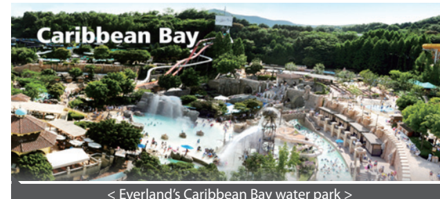
< Everland's Caribbean Bay water park >