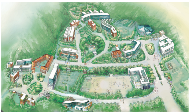
< Campus of Pai Chai University >