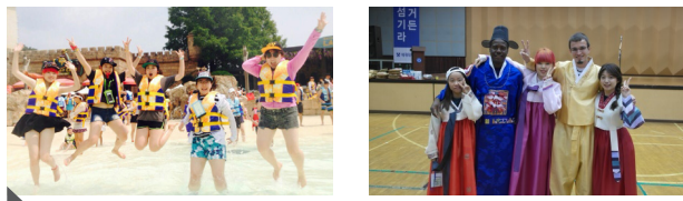
< Activity >